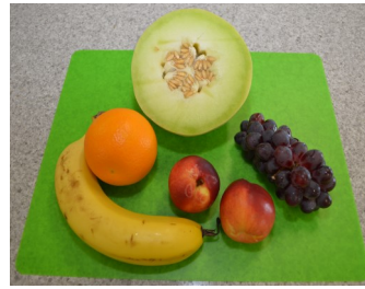
Assorted fruit (enough for 30 people)