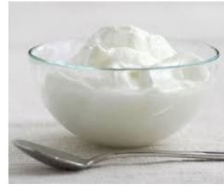
3 cups vanilla yoghurt