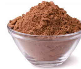
1/4 teaspoon Milo per cup